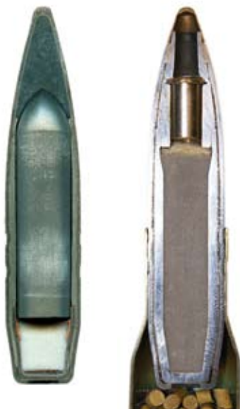
12.7mm BS bullet on the left and MDZ bullet on the right.

The modernized BZT-44M is basically identical to the BZT-44 bullet and only differs from the latter in having a dark tracer up to a distance of 50 - 120m in front of the muzzle. The BZT-44M was adopted by the Russian army between 2002 and 2003.