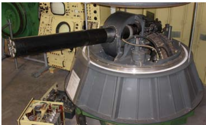
30mm AO-18 Gatling gun inside the AK-630 turret.

In the early 1970's a new generation of destroyers and missile cruisers was supposed to be equipped with the AK-630 anti-aircraft gun. However, the installation possibilities on these ships required a more compact ammunition storage facility than the cabinet-like magazine of the AK-630, so a curved 2,000 round magazine was introduced. The modified weapon system was tested with an improved radar in the Baltic Sea in late 1979. On August 26th 1980 it was officially adopted and received the designation AK-630M. Series production of the improved Close-In Weapon System was started at plant No. 535 in 1972. The AK-630M is one of the most widely encountered Soviet naval anti-air-