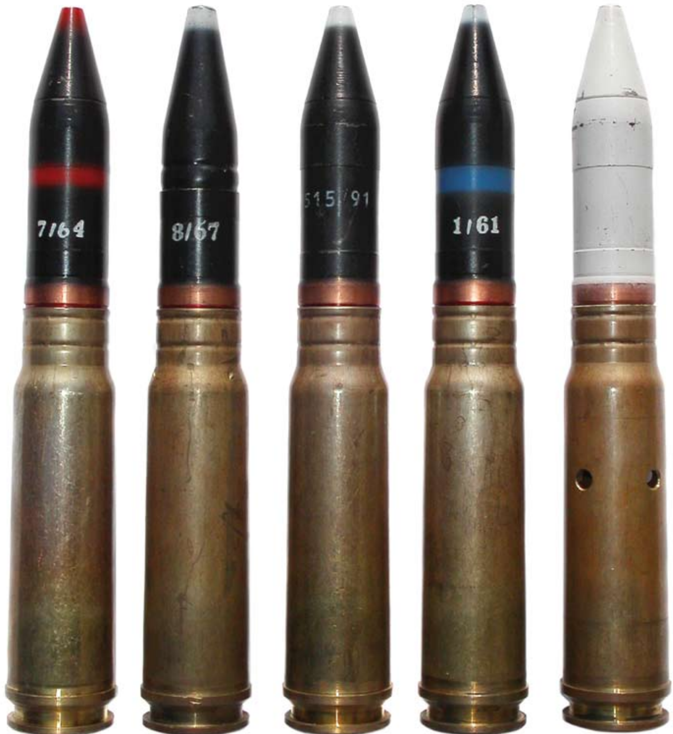
Czechoslovakian NR-30 cartridges from left to right: OFZ, LP-3, LP, reference and drill round. While the other rounds were made during the 1960's, the LP target practice projectile was made in 1991. The reference cartridge consists of a standard LP round and is identified by a blue band.